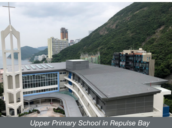
Upper Primary School in Repulse Bay