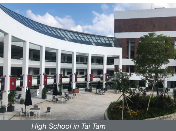
High School in Tai Tam

A co-educational private day school grounded in the Christian faith, Hong Kong International School (HKIS) serves Reception 1 through Grade 12 students from around the world seeking an American college-preparatory education. HKIS is accredited by the United States' Western Association of Schools and Colleges (WASC) and is a member of the East Asia Regional Council of Overseas Schools (EARCOS).