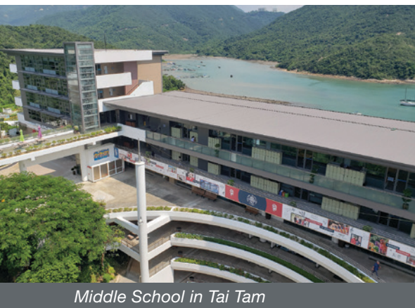
Middle School in Tai Tam