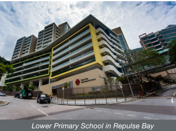
Lower Primary School in Repulse Bay